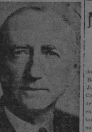
James F. Byrnes

En su carta, el Secretario Byrnes dice: "Somos partidarios de que se forme una China fuerte, unida y democrática, que contribuya al mantenimiento de la paz y de la estabilidad en el Extremo Oriente, así como preparada para fortalecer el Organismo de las Naciones Unidas."